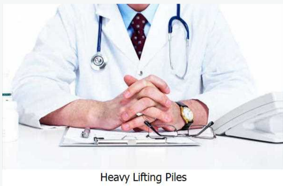
Heavy Lifting Piles

Do you need to know about the hints and signs of hemorrhoids? Each individual like you won't desire to go through a tough ailment. You can absolutely do everything that you'll just to just be sure you will definitely be in top condition. Training daily and even take supplementary nutritional requirements to make sure health. Ensure that you maintain healthy diet to have strong body as well as immune system. Nonetheless, it is still feasible so that you can definitely acquire various health impediments irrespective of how serious you are in keeping in form. Some conditions can attack without knowing it. It's the case in terms of hemorrhoids. You should deal with this ailment sooner before it may become worse.